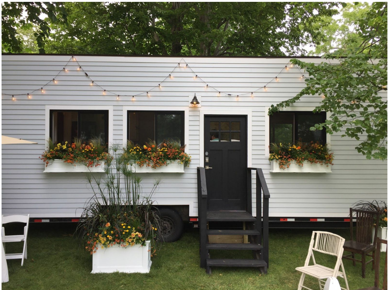
Stony Ledge Exterior

Luxurious and spacious, the Stony Ledge Tiny House embodies the natural beauty of the Berkshires. This RVIA-certified tiny house on wheels boasts a first floor bedroom, tiled bathtub and shower, and quartz kitchen countertops. Built in 2018 in North Adams, MA.